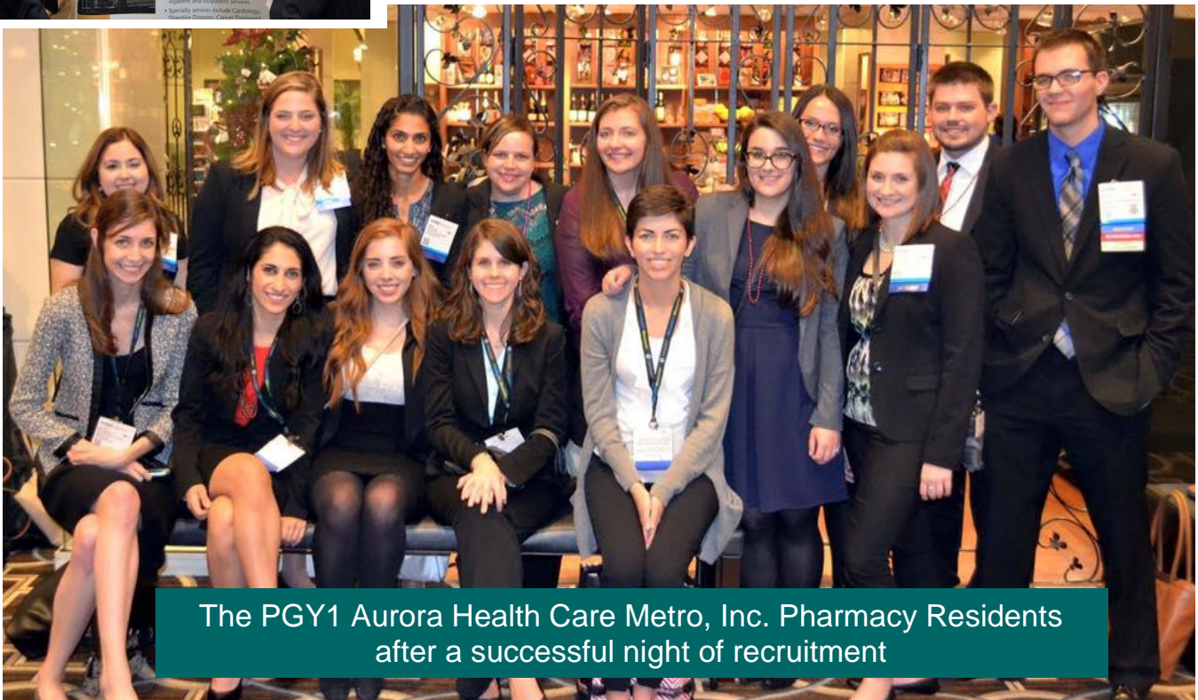
The PGY1 Aurora Health Care Metro, Inc. Pharmacy Residents after a successful night of recruitment