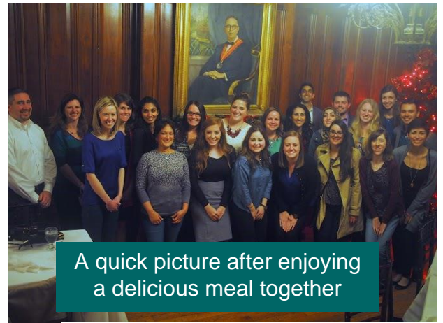
A quick picture after enjoying a delicious meal together