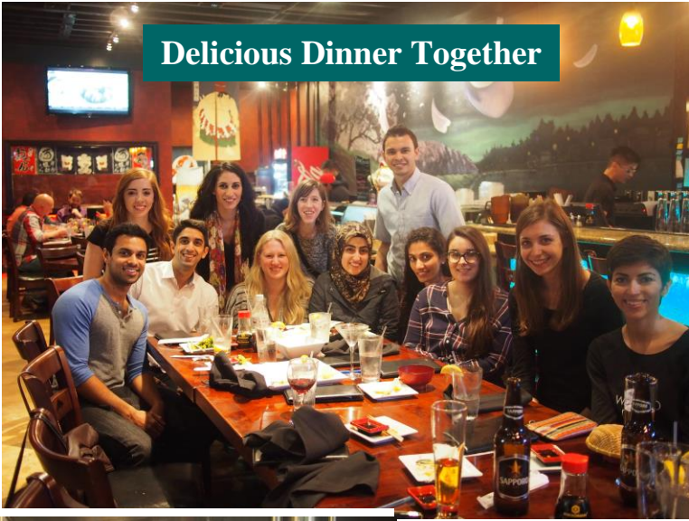
Delicious Dinner Together