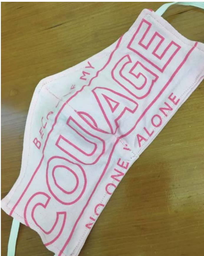
Wearing a face mask covering both your nose and mouth reduces the risk of contracting or spreading COVID; our community partners have provided some masks of inspiration for our patients.

We would like to thank: After Breast Cancer Diagnosis (ABCD), American Cancer Society, Kenosha Cares, Kohl's Healthy Families, Wisconsin Cancer Collaborative, Wisconsin Ovarian Cancer Association (WOCA), anonymous community member donors and our own Aurora Cancer Care team members for their continued support of our patient populations. By sharing their acts of kindness, they have shown us unique ways to stay partnered and continue to strive to provide the best care for our patients and communities. We continue to be grateful for the additional support. ■