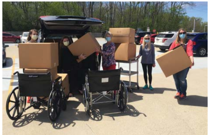
Advocate Aurora team members collecting boxes of donations from our community partners.

Various ways our CBO partnerships have supported our patients and communities include but were not limited to donations of: masks, face shields, hand sanitizers, blankets, post mastectomy comfort pillows, treatment activity bags, online social support, education materials,